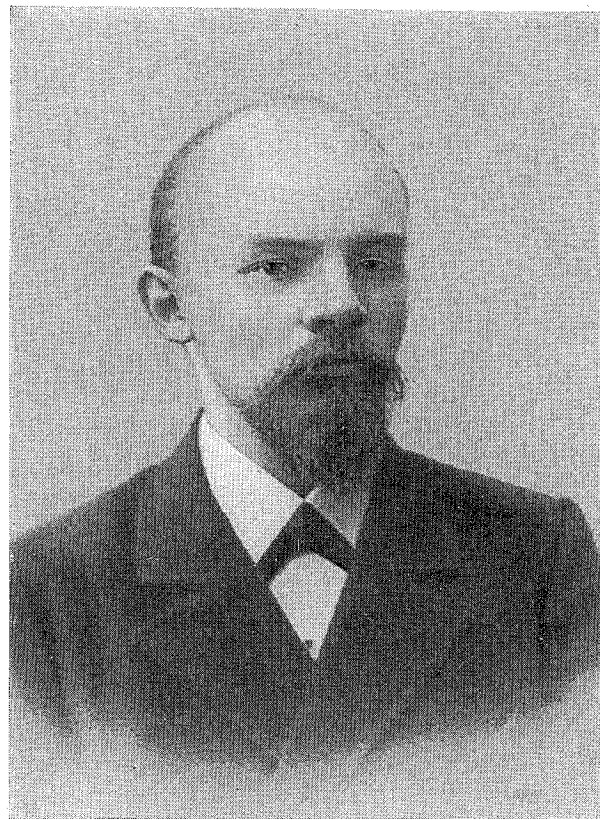
V. I. LENIN 1897

The present volume also contains the "Draft Agreement" with the Plekhanovist Emancipation of Labour group on the publication of the newspaper Iskra and the magazine Zarya , which appears for the first time in a collected edition of Lenin's writings. Iskra was launched on the basis of the "Draft Agreement."