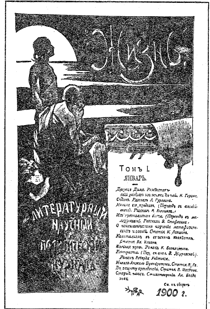
Cover of the magazine Zhizn in which Lenin's "Capitalism in Agriculture" was published in 1900