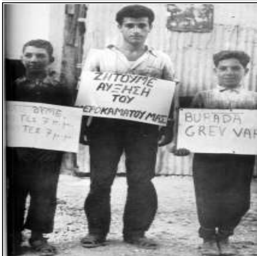
One of the slogans of the Greek and Turkish Cypriot workers say " We are working from 7 a.m to 7 p.m.