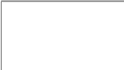
The first trade union was registered according to the law on Trade Unions of 1932, was the Trade Union of Shoeworkers of Nicosia, with 84 members. As it is seen in the picture - the official registration -, the