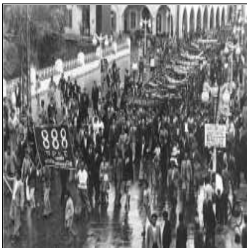
1st of May 1944 March for 8 hours of work, 8 hours of rest In Nicosia Main square. The march was under the guidance of PSE-PEO.