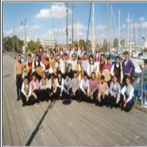
The Trade Union Dancing Group "Vasilitzia"

Trade Union was registered in May 1932 under the number 001. It had its offices at Eleftheria Street number 5.