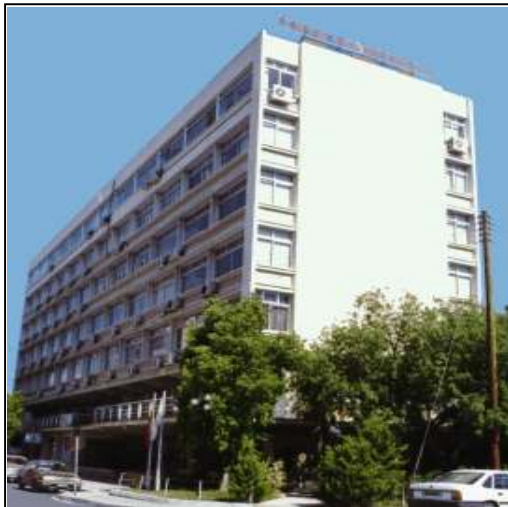
Our Nicosia main building.