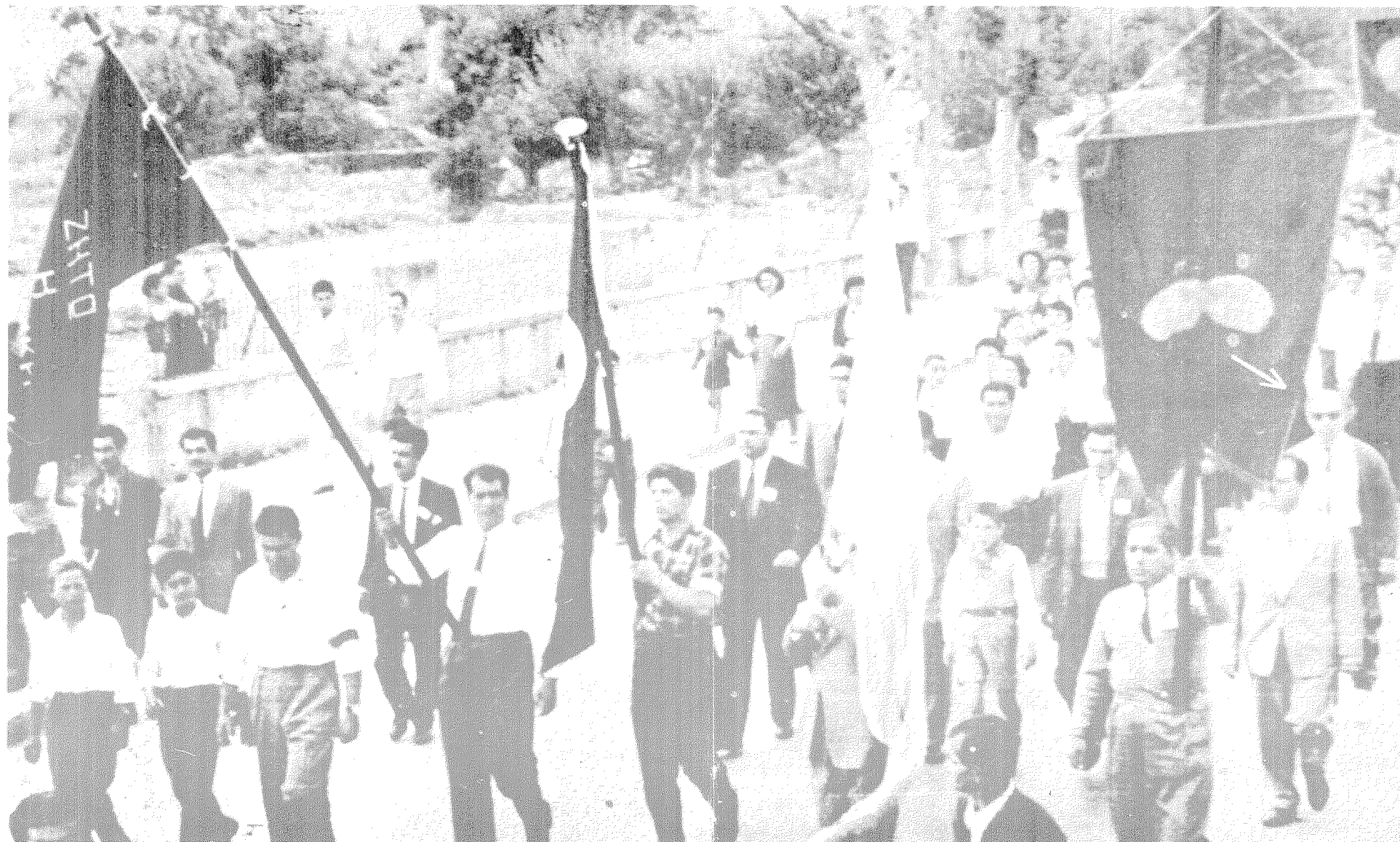
Mayday procession of Greek and Turkish Cypriots in Nicosia, in 1958.