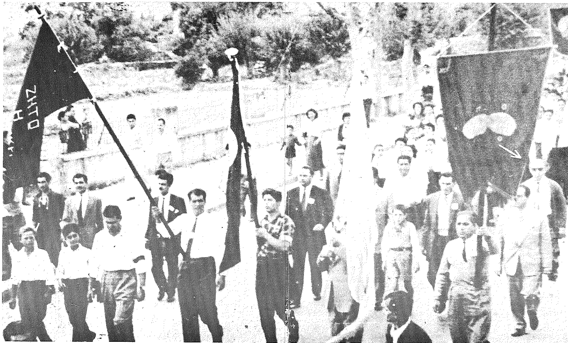
Mayday procession of Greek and Turkish Cypriots in Nicosia, in 1958.