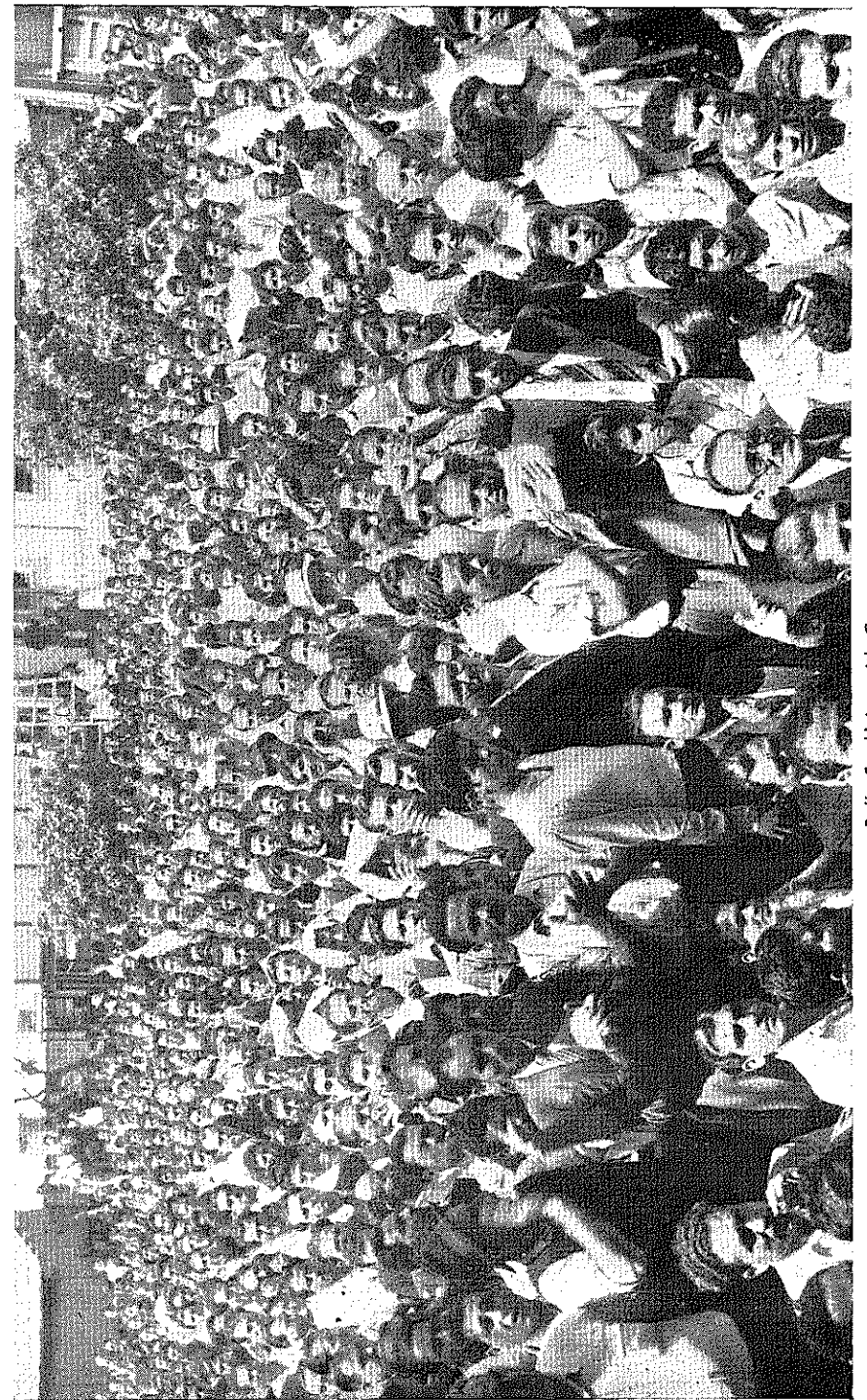
Rally for Union with Greece.

In October, 1946, the then Secretary of State for the Colonies, Mr. Creech Jones, declared in the House of Commons that H.M. Government decided to establish a more liberal and progressive regime in the internal affairs of Cyprus, including the establishment of a Central Legislature, that it will initiate a ten-year plan