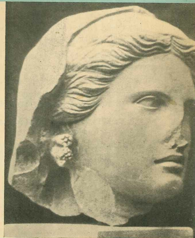
Document prepared by the CYPRUS PEOPLE'S NATIONAL DELEGATION