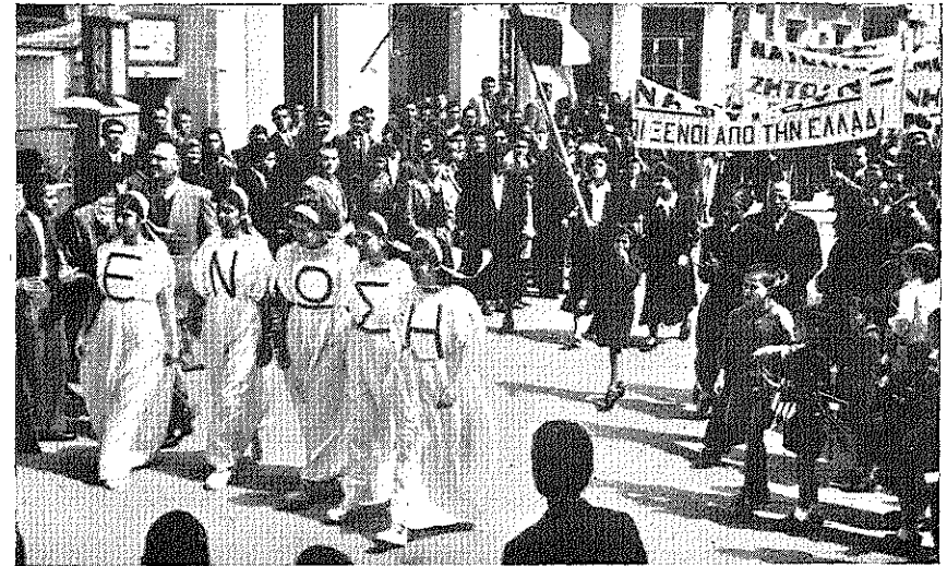
Demonstration for Enosis.

Small industries developed during the war such as button and match factories have closed down and other handicraft industries face serious economic crisis.