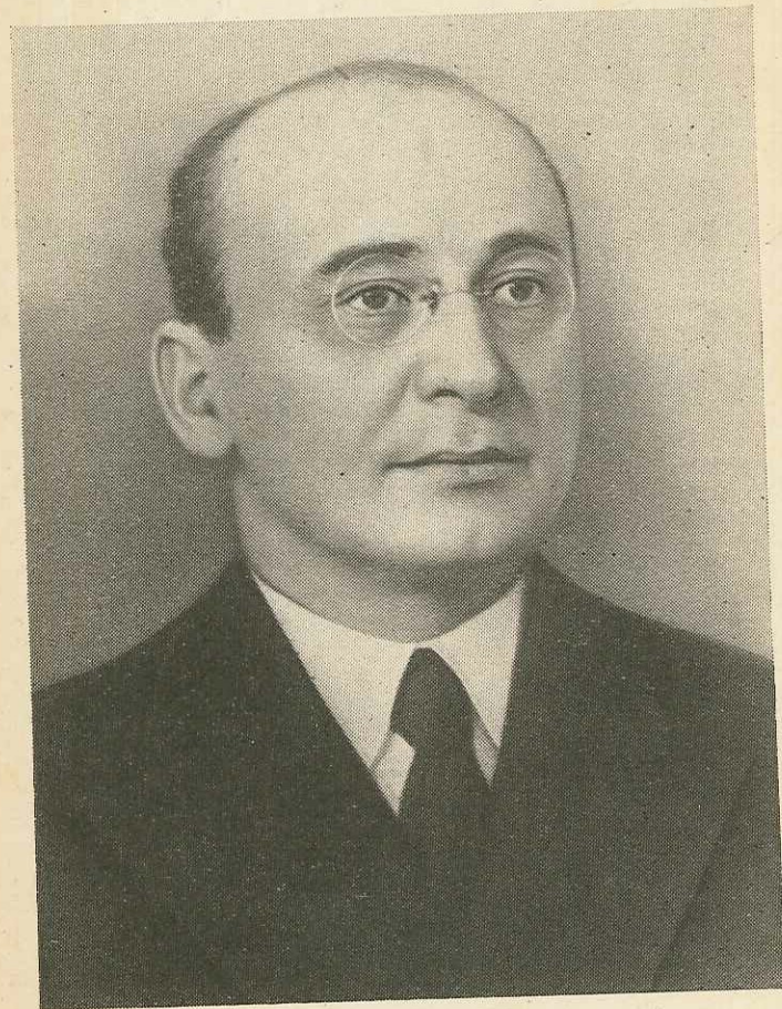
L. P. BERIA